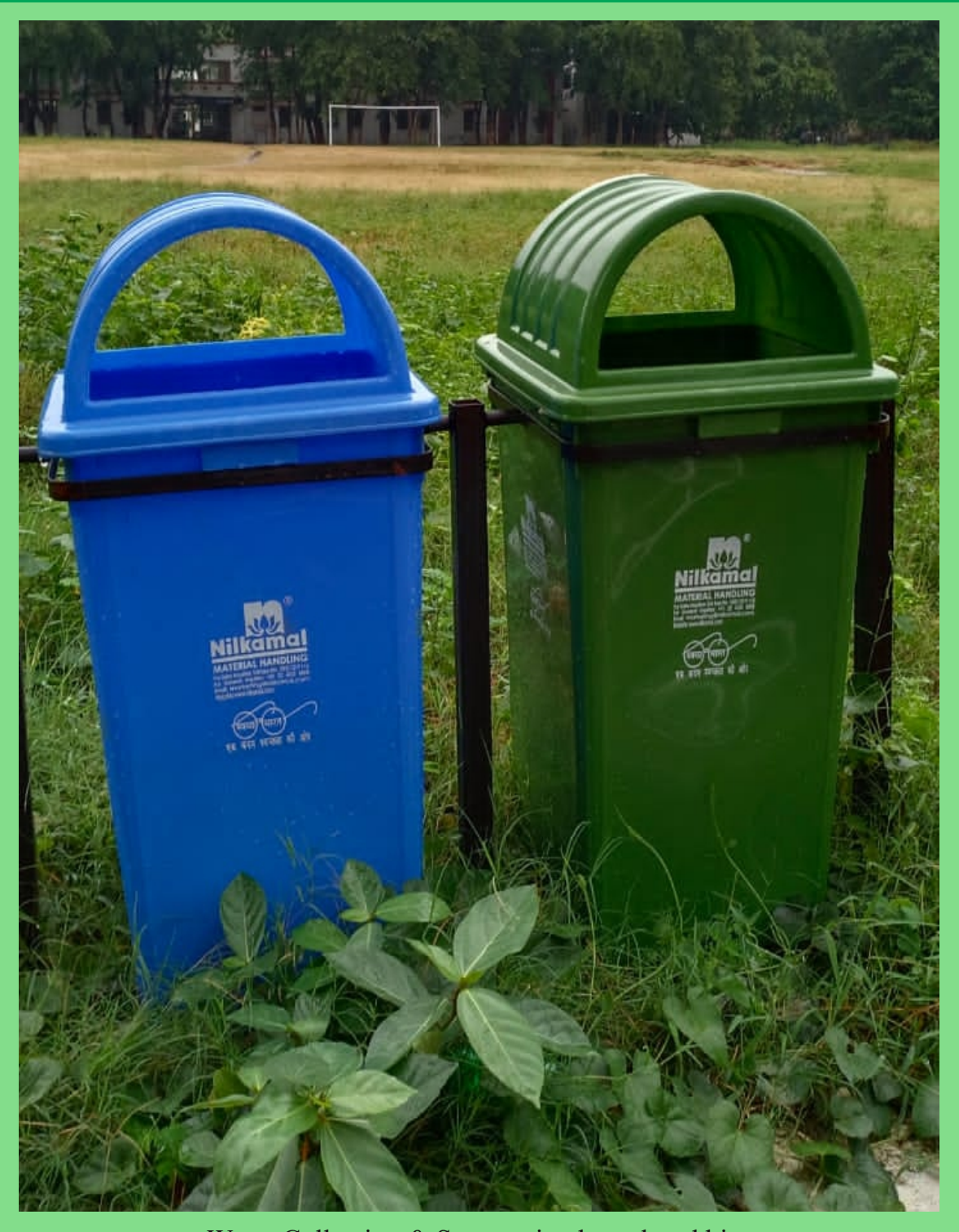
Waste Collection & Segragation by colored bins