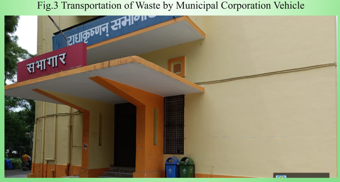
Waste Collection Bins Outside Auditorium