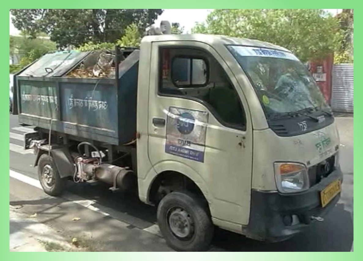
Fig.3 Transportation of Waste by Municipal Corporation Vehicle