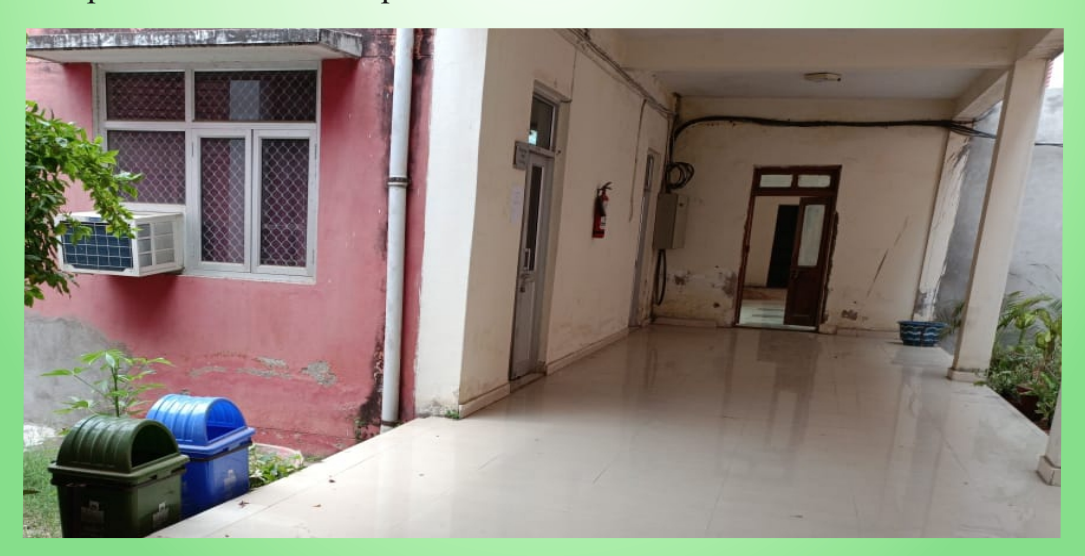
Fig.4 Colored Waste Bins outside the Lecture Theatre