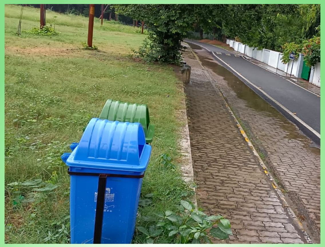
Fig.2 Waste Collection and Segregation Bins outside the LV old Hostel