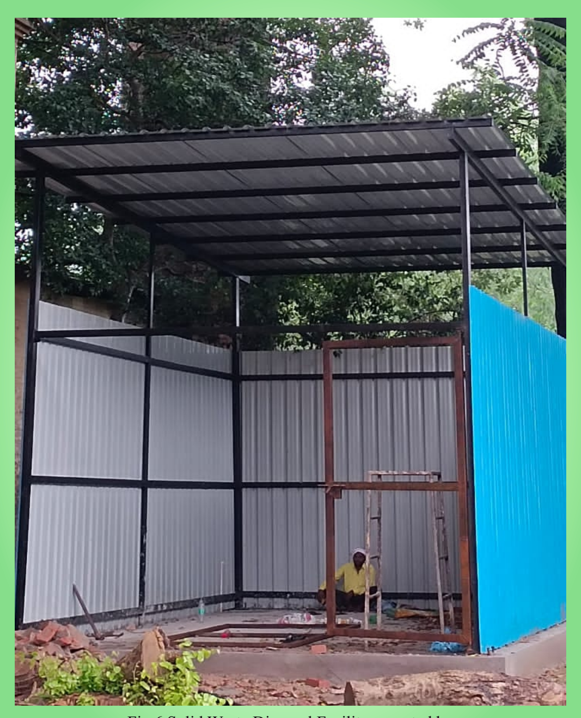
Fig.6 Solid Waste Disposal Facility operated by KNN in the East Campus (Under Construction)