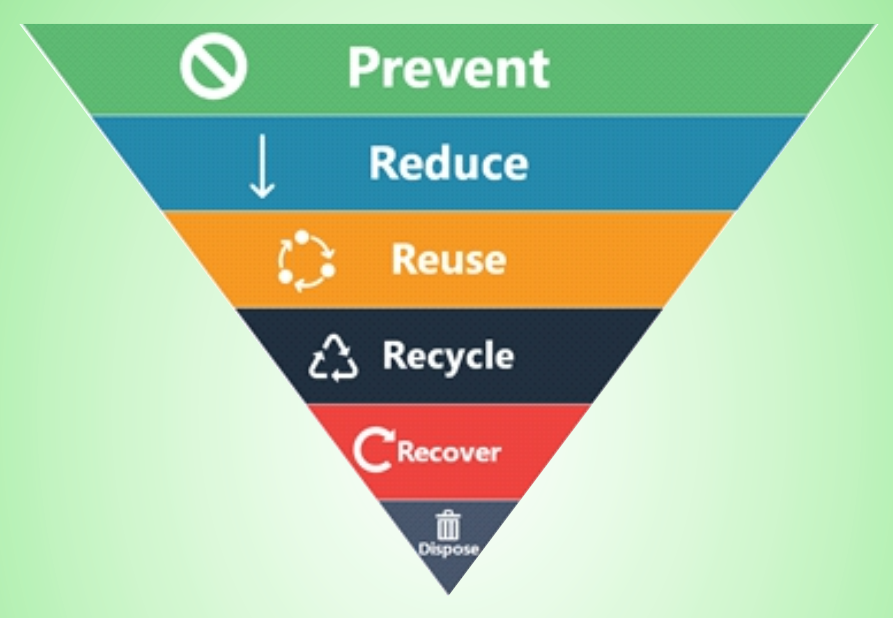
Fig.1.Waste Hierarchy Pyramid (from the most favourable (top) to the least (bottom) Waste minimization at source (prevention)

include; paper, glass, cardboard, leaves/grass of plants, construction/demolition waste and other non-hazardous waste etc. The hazardous wastes generated in the university premises shall be disposed of in an environment friendly manner by taking adequate support of the State Pollution Control Board or registered firms adept at handling of hazardous wastes. In simple terms, the HBTU Kanpur Waste Management Policy shall be based on the following principles: