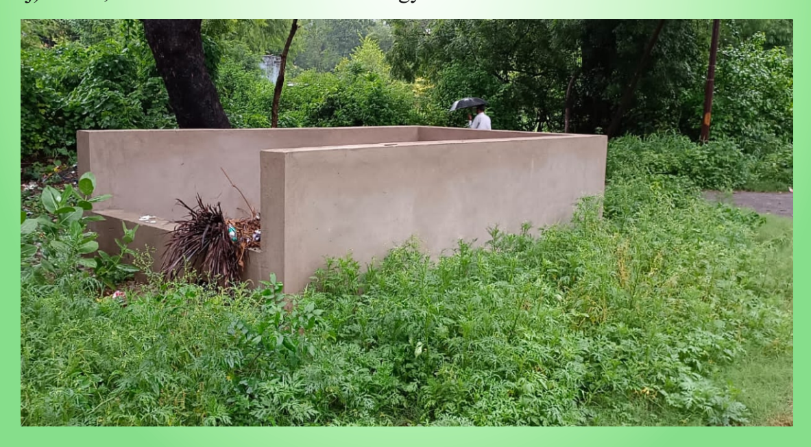
Fig.5 Block Cum Community Storage pit in the East Campus of the University